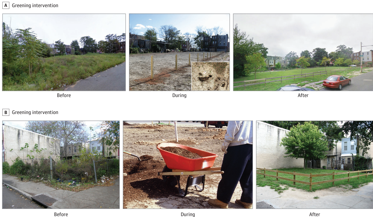
Figure 2. Vacant Lot Main Greening Intervention

Images show blighted preperiod conditions and remediated postperiod restorations. A, The image shows the grass seeding method used to rapidly complete the treatment process. B, The after image shows the low wooden perimeter fence. Vacant lots shown