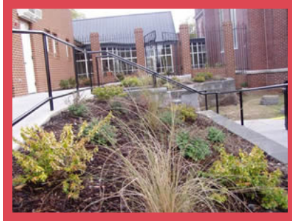
St. Peter's Meditation Garden

Nov. 11 - Annual Meeting and Columbia Choice Awards at the Columbia Museum of Art